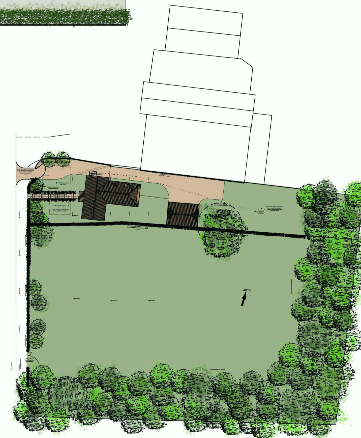
Site Plan (1:500)