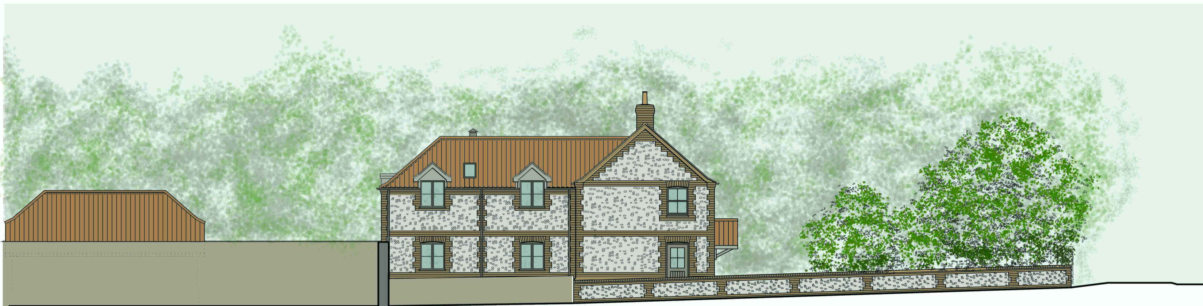
Side Elevation (1:100)